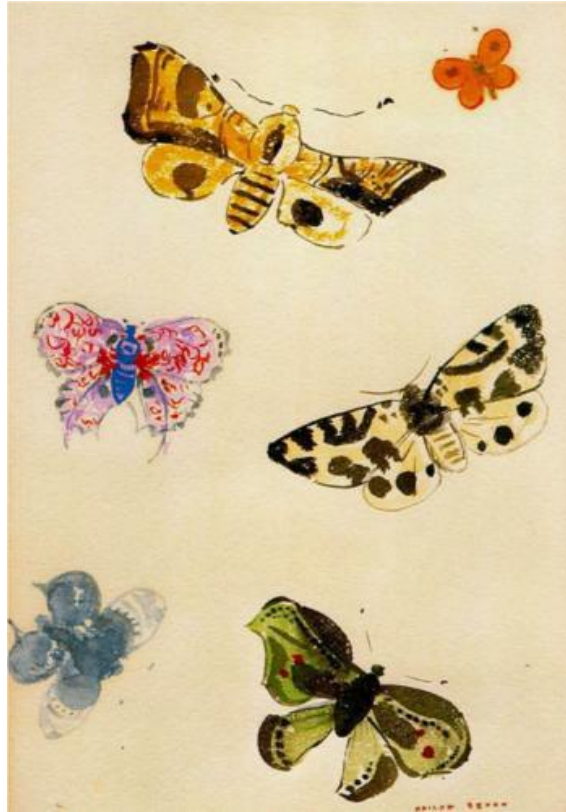
Butterflies by Odilon Redon